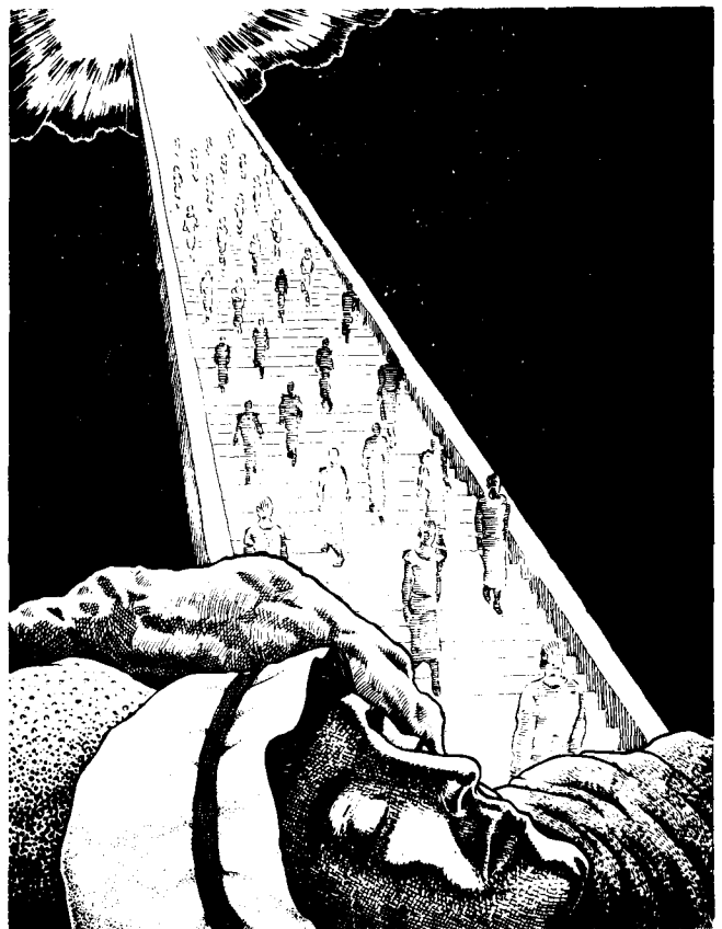
Using a stone for a pillow, the weary Jacob dreamed of a huge stairway descending from heaven.