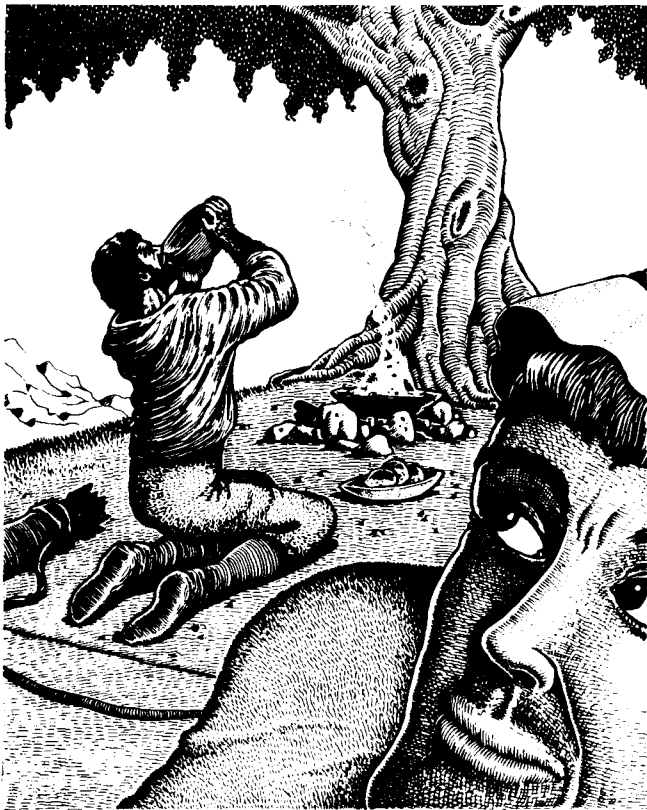
Jacob smiled triumphantly to himself as he watched his brother bolt down the food that cost Esau his birthright.

Years passed and another event occurred between these brothers that greatly affected the remainder of their lives and the lives of their future descendants.