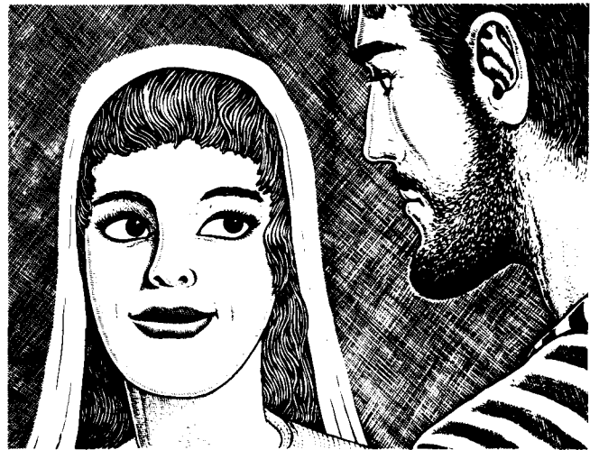
Isaac was impressed with Rebekah's beauty and good manners when he met her.

When Isaac met Rebekah he was impressed by her good manners and beauty. They were married shortly after her arrival (Gen. 24:67). Through this