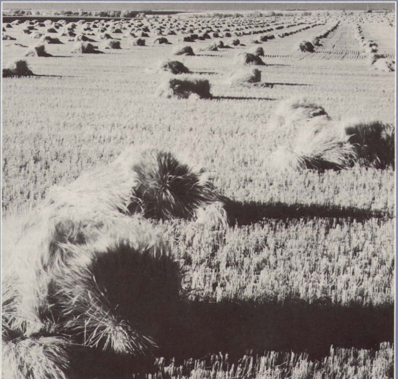
The Fathers of the Promises